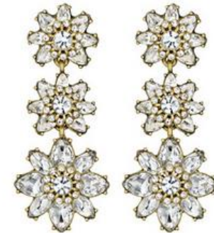
Mirabelle Statement Earrings $58