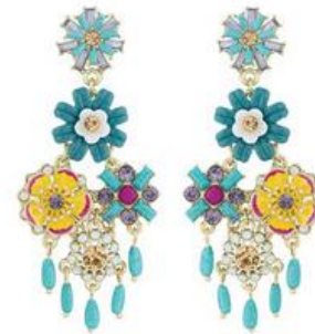
Jardin Majorelle Chandelier Earrings $68