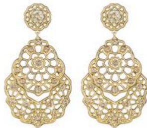
Sunlit Sahara Post Drop Earrings $68