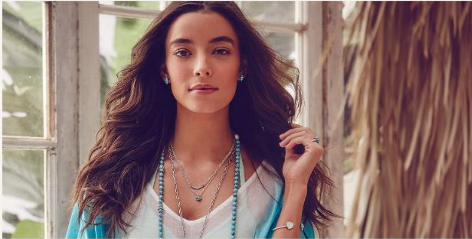
Le Tropic – Summer 2015